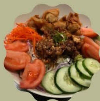
GARLIC CHICKEN SALAD